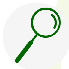
ESOS & SECR Reporting